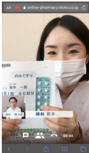
〈Patient screen〉 Video call

We share imaging information between patients and pharmacy pharmacists to provide online medication guidance.