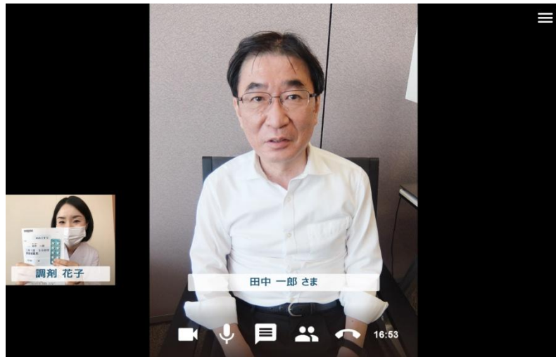
〈Pharmacy screen〉 Video call

*The images shown are for reference only