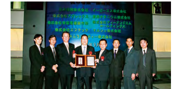
Listed on the First Section of the TSE (September 2006, TSE Arrows)

We were listed on the Second Section of the Tokyo Stock Exchange (TSE) in 2004 and, in 2006, relisted on the First Section. Having our shares listed as one of Japan’s leading pharmacy companies not only gave us greater credibility but also helped raise the overall status of pharmacies and pharmacists.