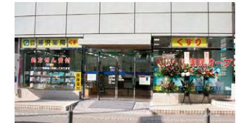
Our first neighborhood pharmacy, Nihon Chouzai Fujisawa Pharmacy (Fujisawa City, Kanagawa Prefecture)

To embody the true separation of drug prescribing and dispensing services, we are building a network of neighborhood pharmacies, which do not depend only on specific healthcare institutions but fill prescriptions from multiple institutions and serve as community healthcare hubs. We defined locations that offered the greatest convenience to customers and expanded our pharmacy network, drawing on Nihon Chouzai’s distinctive marketing methods and other expertise. We went on to develop hybrid pharmacies.