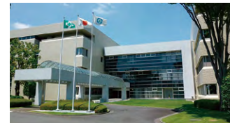
Nihon Generic’s Tsukuba Plant, opened in the Tsukuba Northern Industrial Park

With the aim of addressing the issue of healthcare personnel shortages and avoiding poor fits, we established Pharma Staff (now Medical Resources) and launched Japan’s first pharmacist staffing business. Drawing on the pool of educational expertise of Nihon Chouzai’s pharmacist business, we are contributing to the creation of a sustainable healthcare framework.