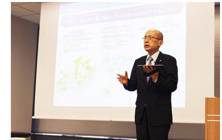
Long-term vision briefing session

The third pillar, becoming a Group that continues to innovate, is something I believe Nihon Chouzai is especially well-positioned to pursue as a company that has always prized originality and a pioneering attitude. We have developed a variety of ICT tools in-house, related to pharmacy operations, and have been taking advantage of these to provide services to patients. Numerous healthcare institutions were damaged in the Great East Japan Earthquake of 2011, and their medical records were lost. However, because our company had already digitized patient prescription information, it was possible to prescribe drugs even in disaster-stricken areas. Drawing on this experience, we developed our electronic medication notebook, Okusuri Techo Plus , which already has over 2 million subscribers. At the same time, some of the technological advances we are seeing today are simply astounding. An over-emphasis on self-reliance and on being distinctive runs the risk of causing us to fall behind in terms of technology and services. Going forward, therefore, we will continue to embrace the challenge of innovating through collaboration and co-creation with other companies.