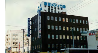
Aso Medical Center, our first medical center-type pharmacy

We carved out our own market by encouraging the still nearly un-practiced separation of drug prescribing and dispensing services among clinics in Sapporo, and opening “one-on-one pharmacies” near the clinics. The year after our founding, we opened unique medical center-type pharmacies to offer patients greater convenience, and went on to expand into the separation of drug prescribing and dispensing services for large hospitals as well, growing in business scale while further helping spread the separation of these services.